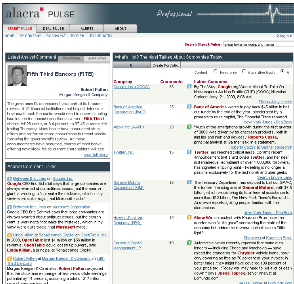
Fig 1 – Home Page of Alacra Pulse Professional: Street Pulse

"A search box on the top right allows users to search by company ticker or name."